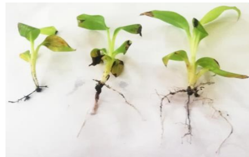
Figure. 3: Photograph shows ex vitro root formation on shoot cuttings using 0, 1, 2 mg/L IBA (from right to left) and watered with tap water for six weeks.