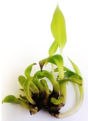
Figure. 1: In vitro shoots obtained from banana tissue culture with MS medium supplemented with 3 mg/l BAP for six weeks.

Banana shoot culture was established by extraction of cone-shaped shoot tip explants from sword suckers and culturing on MS medium supplemented with 5 mg/l BAP and 30 g/l sucrose. Phenol accumulation on the initial explants was avoided by aseptically transferring of cultured explants to fresh media (MS medium supplemented with 5 mg/l BAP and 30 g/l sucrose) three times at two weeks intervals. The obtained shoots on initial explant were subcultured on the same type of medium (MS medium supplemented with 5 mg/l BAP and 30 g/l sucrose), each three weeks to achieve mass multiplication (Figure.1). In vitro obtained shoots were cut and used for determination of growth parameters under the applied conditions and induction of in vitro and ex vitro root formation.