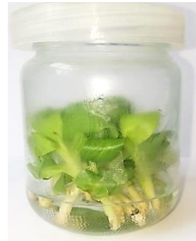
Figure 2: Shoot cuttings subjected to 0.1 mg/l IBA for 24 hours in closed jar to induce root formation ( ex vitro hydroponic procedure).

In vitro root formation procedure was carried out on half strength MS medium containing 1 mg/l IBA and 15 g/l sucrose for 3 weeks. Under these conditions, all shoot cuttings showed extensive root formation that was necessary to carry out acclimatization procedures.