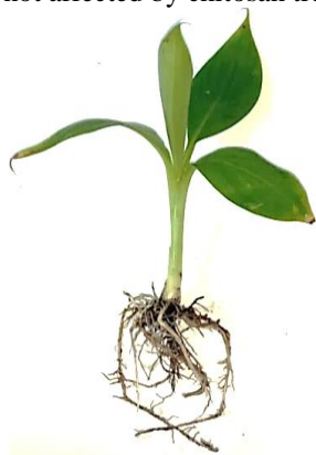
Figure 4: Shoot cuttings subjected to 0.1 mg/l IBA for 24 hours in closed jar to induce root formation ( ex vitro hydroponic procedure).

When root formation was carried out in vitro on half strength MS medium with 1 mg/l IBA, each plantlet formed 4 or 5 roots with length of about 3-9 cm within 21 days. Furthermore, when rooted plantlets were transferred to acclimatize under transparent plant bags, the number of roots increased with the increasing of the acclimatization time up to 21 days (Table 3). In 65 days, the number of roots of different treatments did not differ significantly, while roots length increased non-significantly, with the appearance of secondary roots (Table 4 and Fig. 4). Data indicated that the number of roots during the acclimatization period was not affected by chitosan treatment (Tables 3 and 4).